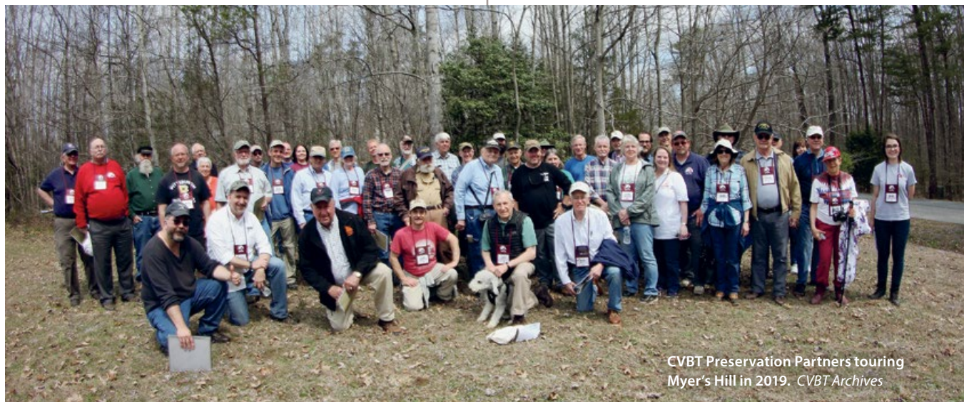
CVBT Preservation Partners touring Myer's Hill in 2019.

On behalf of the Central Virginia Battlefields Trust, and myself, thank you for being our Partners in Preservation.