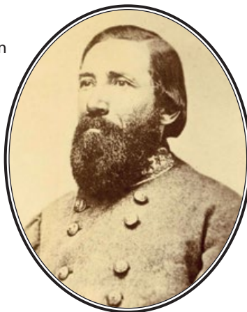
Confederate General Cullen A. Battle led the counterattack that halted the Union breakthrough at Saunders Field on May 5, 1864.

Modern Route 20 (historical Orange Turnpike) borders one side of General Battle's Counterattack Tract. Sarah Bierle