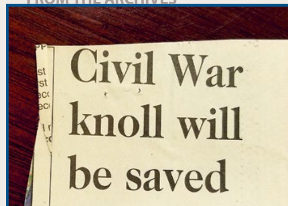
Headline from a newspaper announcement