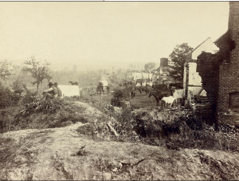
In this Civil War-era photograph, structures and Confederate fortifications are visible on Willis Hill.

The Army of the Potomac suffered its most lopsided loss of the Civil War, suffering more than 13,000 casualties, compared to fewer than 5,000 Confederate losses. The bulk of those casualties came at the foot of Marye's Heights, anchored by the Confederate artillery atop Willis Hill.