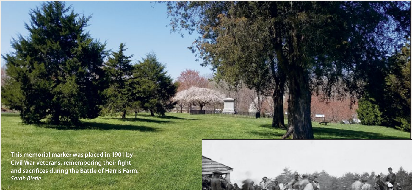
This memorial marker was placed in 1901 by Civil War veterans, remembering their fight and sacrifices during the Battle of Harris Farm.