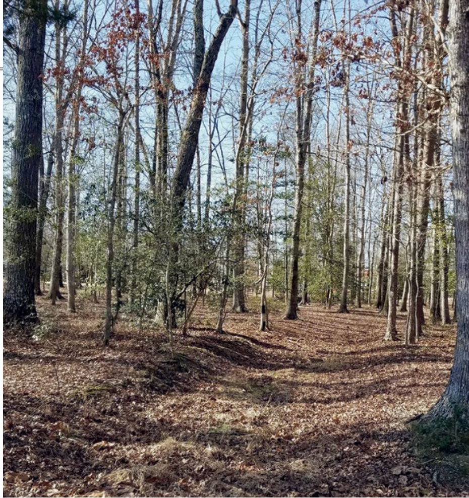
The old trace of the Culpeper Mine Road runs across General Battle's Counterattack Tract on The Wilderness Battlefield. Sarah Bierle

I hope that you have a safe and enjoyable summer and get to visit more battlefields soon.