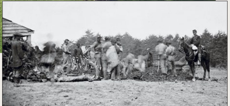
This photograph from 1864 was taken when survivors of the 1st Massachusetts Heavy Artillery buried their fallen comrades after the Battle of Harris Farm.

The 1st Massachusetts Heavy Artillery suffered 394 casualties, almost 25 percent of its strength. Corporal J.W.