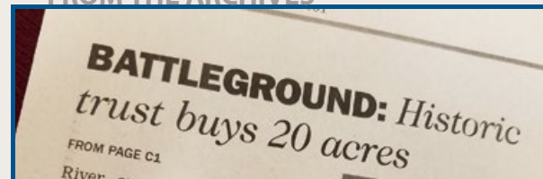
Newspaper headline announcing CVBT’s first land save at Po River and Spotsylvania Battlefield.