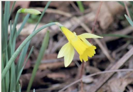
A springtime daffodil at Myer's Hill

This support makes a difference for the future of Myer's Hill as a historic site and piece of community greenspace near Spotsylvania Court House.