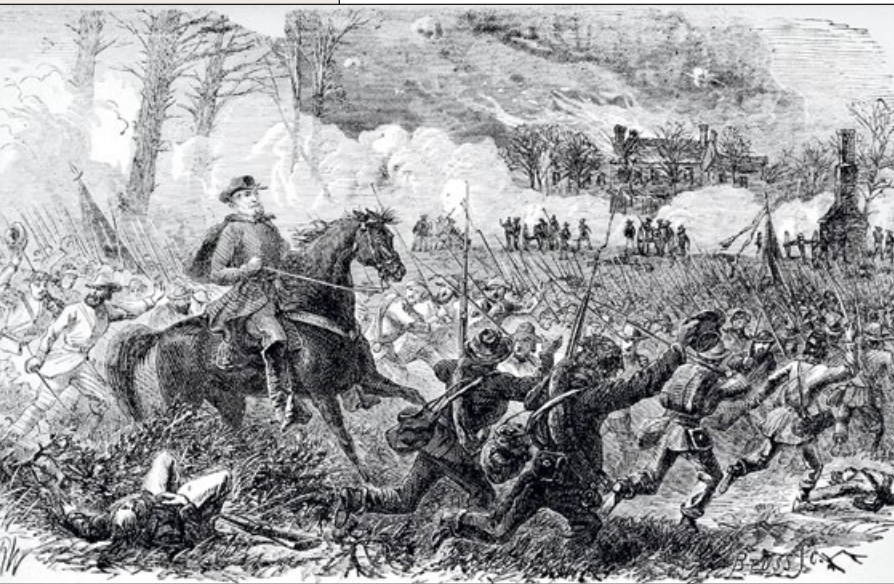
Confederate General Robert E. Lee watched part of the Battle of Chancellorsville from a rise of ground at McLaws Wedge.

Confederates made a final push, advancing "from right to left all along the line with their blood-curdling yells, [and] some of the troops, who had nothing but the bayonet to resist them, fell back." By midmorning, May 3, Confederates finally swept the field, although the Federals did generally withdraw in good order. The bottom of the hill, as Meade predicted, had ultimately proved indefensible.